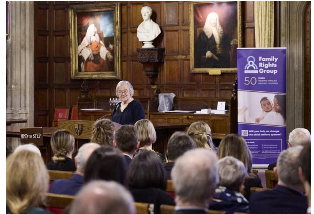
Family Rights Group 50 th Anniversary Legal Lecture